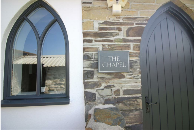
Front door leading into the hallway.