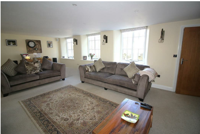
Three windows to the front aspect, various power points, downlighting, doorway leading to the cloakroom, doorway leading into the kitchen/diner.